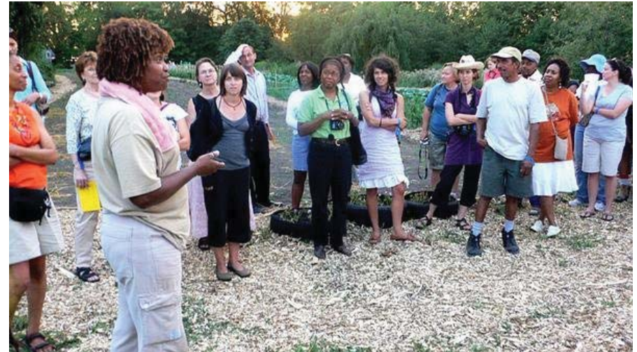
Image 10 & 11: Urban agriculture in Detroit.

Council to “change decision-making power in the food system.” (Yakini, 2010) The DFPC has taken painstaking steps to ensure “inclusivity and transparency” in its process, which Yakini feels has “built support and legitimacy” for the Council. Yakini vows that the DFPC will continue to offer multiple entry points for stakeholders to participate in changing the food system, whether through subcommittee membership, partnerships or community hearings.