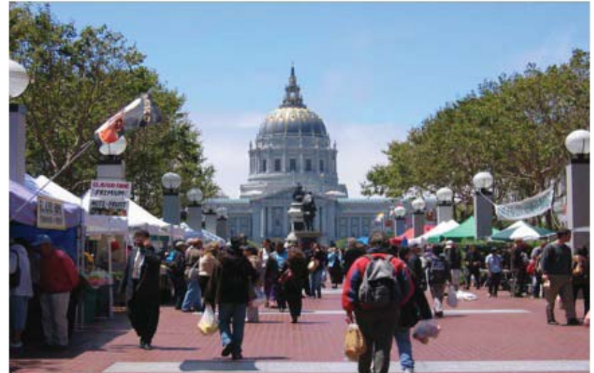
Image 2. Farmer’s Market at City Hall in San Francisco.