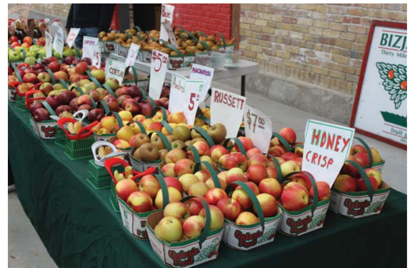
Image 4. Indoor Farmer's Market in Toronto.

Interviews for the other three case studies were conducted via telephone and follow-up questions and discussion occurred with several interviewees via email for weeks throughout the duration of this study. In addition to formal interviews, several of the interviewees in all four cases shared with me personal analysis, draft documents and other formal documents not otherwise available to the public. I also drew from newspaper articles, scholarly publications, government staff reports, policy documents, publically available presentations and correspondences, and organizational websites specific to the case studies and to Food Policy Councils generally.