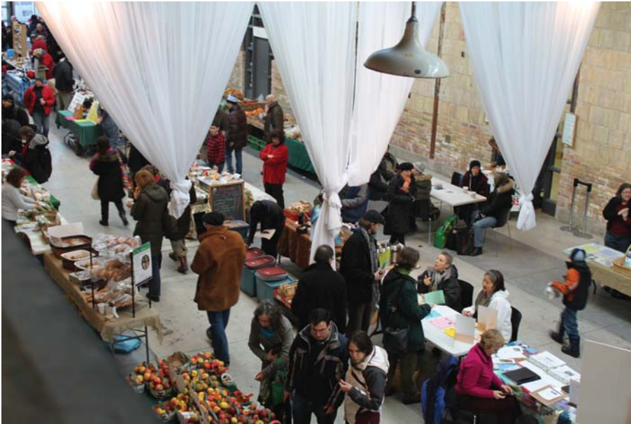
Image 6. Patrons meander at a Farmer's Market in Toronto.