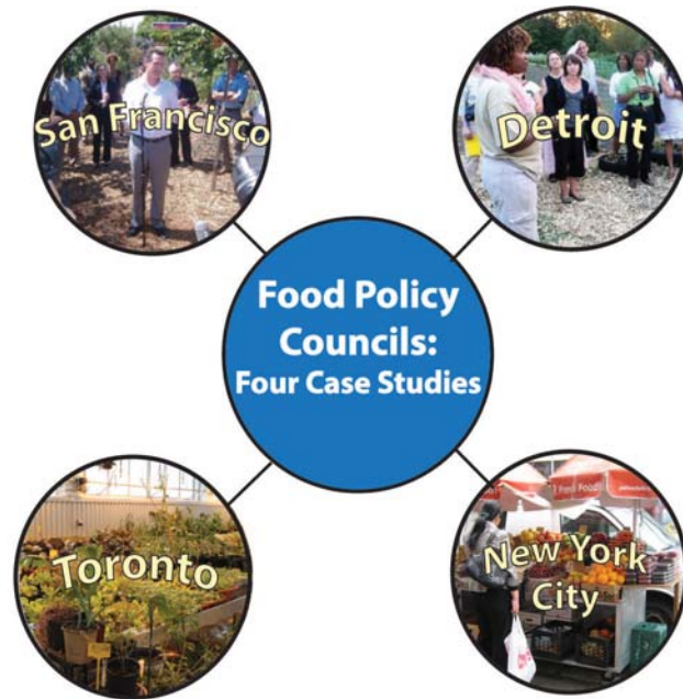
Image 3. Four Case Study Food Policy Councils.

Policy Council acts as an anchor case study because of its prominence in the history of Food Policy Councils and thanks to the generous support of the Hildebrand Fellowship for Canadian Studies, which allowed me to spend nearly a week in Toronto in January. While in Toronto, I formally interviewed six current Council members, the current and former Managers of the TFPC, the co-chair of the Toronto Youth Food Policy Council, two former Council members and one staff from Toronto Public Health who works closely with the TFPC. I was invited to attend a “closed session” meeting of the TFPC and I toured two local non-profits working on food access and urban agriculture in Toronto.