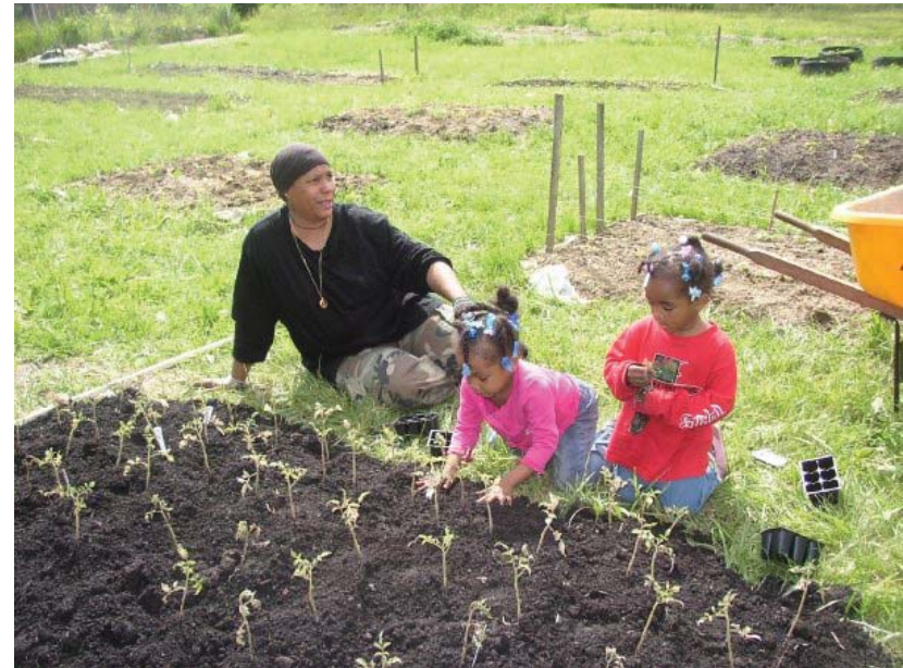
Image 9. Community members enjoy a garden run by the Detroit Black Community Food Security Network.

enlisted the DBCFSN to conduct a public research process to devise such a policy (Yakini, 2010).