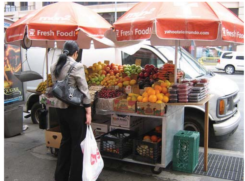
Image 12. New York City Green Carts, an initiative of the Food Policy Coordinator

For all intents and purposes, the advisory team supporting Speaker Quinn's efforts functions in much the same way a Food Policy Council does. Similarly, the Food Policy Task Force connected to the Office of the Food Policy Coordinator parallels that of the San Francisco FPC in that it is a body of public officials called together to advise on the