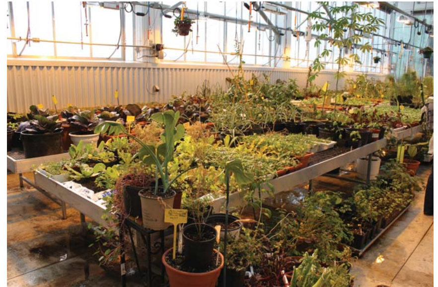
Image 7. Indoor food production at The Stop, an anti-hunger organization in Toronto. Several staff at The Stop are current or former TFPC members.

Several TFPC members and other leadership from non-governmental organizations describe the TFPC as operating an "inside/outside strategy" between government and community stakeholders. A commonly held perception is that the TFPC adds value to a local movement for food equity and sustainability by navigating "inside" government discussion on how the city can support community initiatives or change policy to empower community-driven progress. At the same time, the TFPC animates and coordinates stakeholders to engage with government to make change or push for specific policy reform, as needed. The TFPC builds the capacity of community-based organizations by training leaders in the "inside/outside" strategy, increasing their ability to access resources and navigate government, which sometimes, as Rod MacRae describes, "could make the difference in Council votes." (MacRae, 2010) MacRae says the TFPC has the ability to "reduce frustration among activists and increase insight about levers of power." In other words, the TFPC stimulates more effective public participation in government activity in the food system.